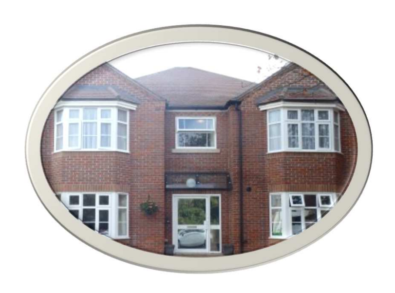
Rusthall Respite, Tunbridge Wells 5 Bedded Unit