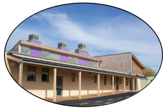
Windchimes – Herne Bay 6 Bedded Unit Jointly funded by KCC and Health Authority