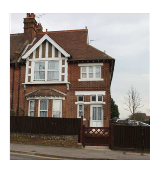
Canterbury ASU – Canterbury 5 Bedded Unit