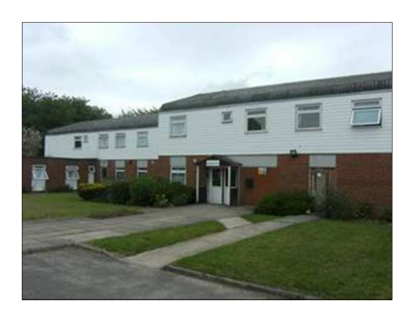
Osborne Court – Faversham 13 Bedded Unit