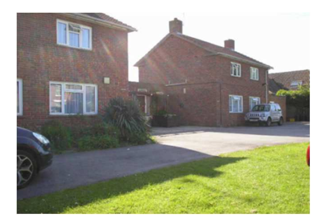
Hedgerows Staplehurst 5 Bedded Unit