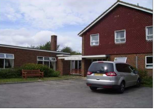
Southfields – Ashford 15 Bedded Unit